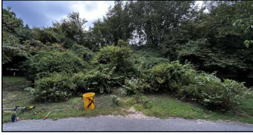
9/11 Garden area before