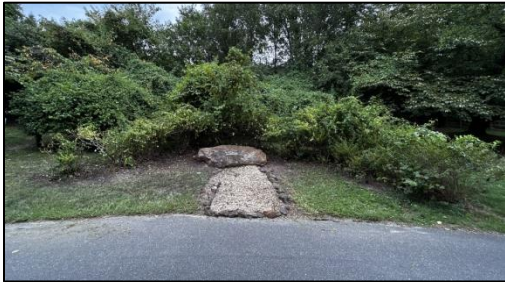
9/11 Garden area after