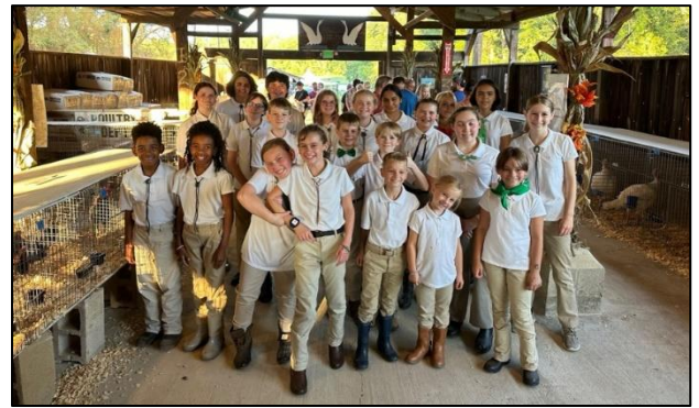
4-Hers at the county fair

The 72nd annual Anne Arundel County Fair was another successful event for Kinder Farm Park 4-H. All the 4-Hers learned a lot this year and had a ton of fun. Many of our 4-Hers won champion awards and prize money for their hard work. The 4-Hers spend all year raising their animals and completing their projects for fair week and have a lot of work to do for it. Everyone who participated in the fair this year did a great job on their animal projects and indoor exhibits. Soon, Kinder Farm Park will get their new baby animals to start raising for next year. And we can't wait for another productive and successful year.