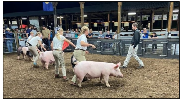
Showing pigs at the fair

Thursday evening of the fair was the goat show followed by the steer show, Friday evening was the pig show, Saturday morning was the sheep show, and Sunday had both the dairy goat and dairy cow shows.