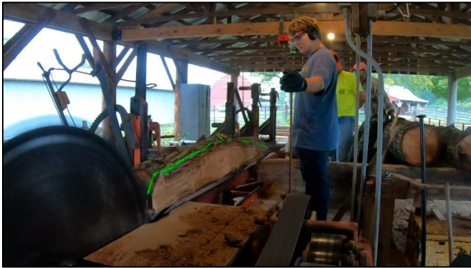
Forklift Cody sawing with the new laser system

We've switched out the carbide bits (the cutting teeth on the saw blade) to high-speed steel. This is a strong metal that can be sharpened by hand. Every week or two, depending upon how much dirt and mud we saw, Tom Two manually sharpens the bits with a file. The saw literally sings through logs now! I am not sure I've ever seen this saw cut so straight and so fast before. As an added benefit, the saw blade runs cooler, and the engine requires less horsepower. The gas consumption likely decreased too.