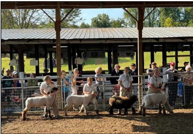
4-Hers showing their sheep at the fair

There's a lot of work to get your animal ready before you can go into the ring. They have to be washed numerous times. Their hair or wool needs to be trimmed and brushed. Their hooves need to be clipped. When it's time, it's so fun to show each animal. We work with our animals almost every day for many months so that they will be used to walking around a ring and getting stopped and moved around.