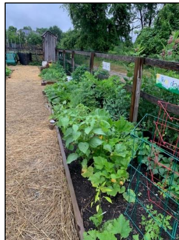
Family plots and straw covered pathway

The University of Maryland Extension programs are open to all citizens without regard to race, color, gender, disability, religion, age, sexual orientation, marital or parental status, or national origin.