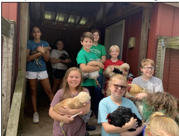
4-H Kids with their chickens ready for the fair

The turkeys are quite large, so we feed and water them, and try to go and play with them, but it does not always work to socialize them. Then we get them ready to go to the fair!