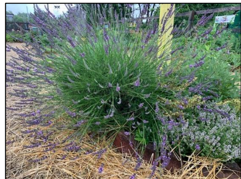
The herb garden