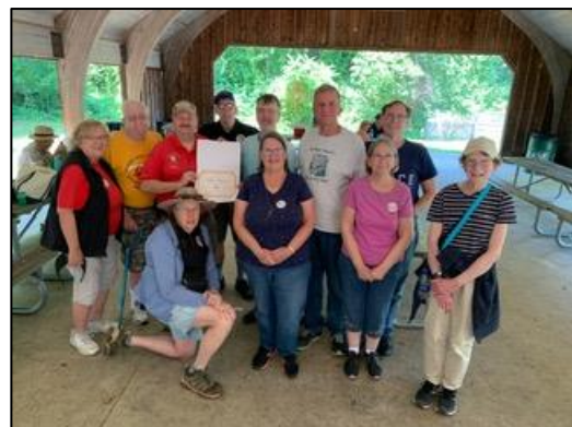
Volunteers that worked the event