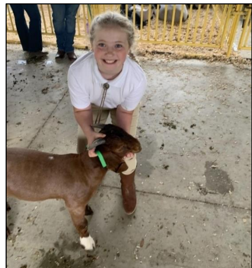
Showing our goats (Continued on next page)