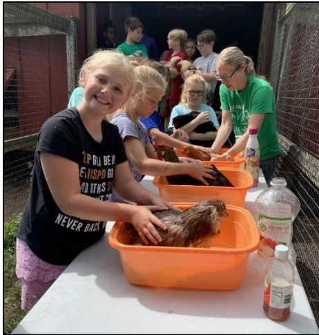
4-H Kids getting their chickens ready for the fair by washing them in three separate baths: warm water with soap, warm water, and water and vinegar.

I also have two poultry projects at Kinder Farm Park - a chicken and a turkey. I have to do many of the same activities to care for them as I do with my goat. I go over to feed them and give them water. We collect the chicken eggs from our chickens daily - you can buy them at the gatehouse from time to time. I take my chicken out of the chicken coop to play with her and socialize her - this is important so that she is friendly when I show her to the judge at the fair. The last thing I do is wash her right before the County Fair too.