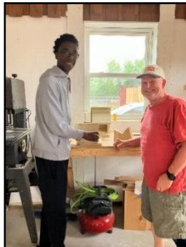
Volunteers at work in the Woodshop

Not pictured is Max Denver, age 9. Max and his mother visiting the park showed interest in the bird house project. Soon Max with a screwdriver in hand and some basic instruction helped assemble one of the Barn Swallow houses.