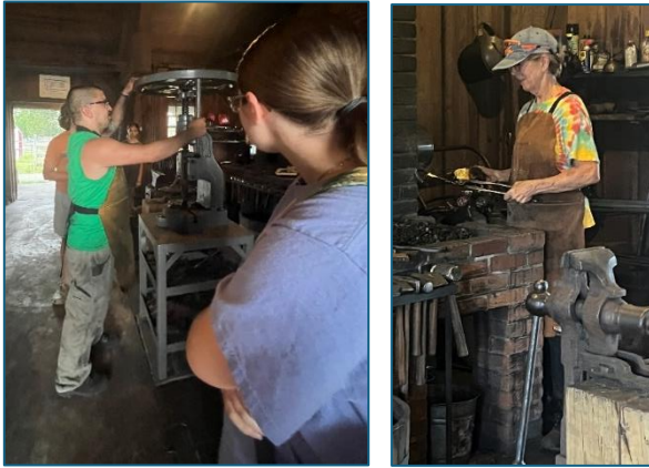
Blacksmiths demonstrates tools for 4-H Club members

In the blacksmith shop, they explained the basic blacksmith tools and procedures. They also showed us some projects they have been working on. The June 4-H Education meeting was a lot of fun learning about the amazing history of Kinder Farm Park!